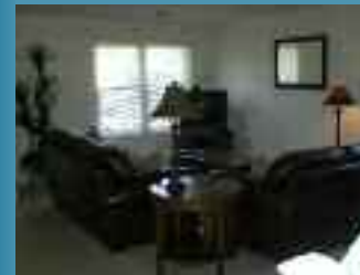
The Living and Learning House room before the make-over.