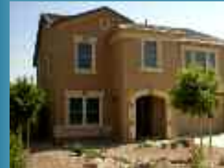
The Living and Learning House.

Arizona Landscape Contractors' Association has joined forces with members of their association to provide a beautiful garden and meeting area for girls in our Transitional Living Program. The new garden is located behind our Living and Learning House and includes a large covered patio, vegetable/herb garden, and meditation-quiet space, surrounded by flowers, trees and shrubs. In addition, Dunkin Donuts has generously granted funding for patio furnishings. The garden is scheduled to be completed by mid-November. Thank you to both organizations for this wonderful opportunity!