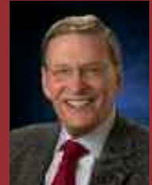
Allan H. (Bud) Selig

Mark your calendar for Florence Crittenton's seventh annual spring fundraiser. This year we are pleased to welcome Allan H. (Bud) Selig , Commissioner of Major League Baseball, as our keynote speaker. Our HOPE Award recipient will be Allison DuBois , best selling author, community volunteer and inspiration for the TV show "Medium."