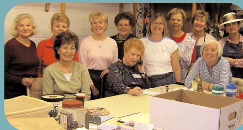
Auxiliary members prepare for the rush of closing day

We value your questions and comments! Please also let us know if you would like this newsletter sent to a friend.