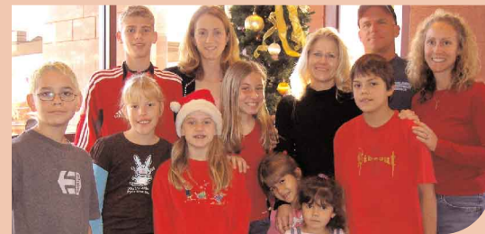
Vineyard Church members shared their holiday cheer with the girls

We were overwhelmed with your generosity during the holiday season! Hundreds of gifts and donations poured in during December, which benefited several of Florence Crittenton’s programs. Below is a list of people who made the holidays extra special for our kids by making a donation and giving their time to sort and wrap holiday gifts.