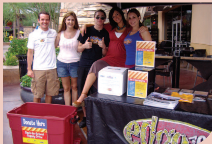
The Edge 103.9's promotional crew was a big hit at Desert Ridge Marketplace.