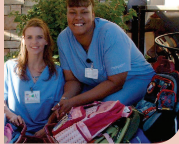
Ethel Bauer nursing students donate more than 40 backpacks full supplies!

A special thanks also to the many individual donors whose generosity helped make this year's event such a great success!