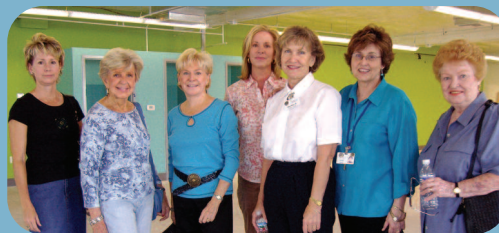
Auxiliary members tour the new shop during construction

Our ladies' Auxiliary always keeps the girls busy during the holidays, and this year will be no exception. From parties to crafting and concerts to plays, they make sure that each girl has special memories of this festive season.