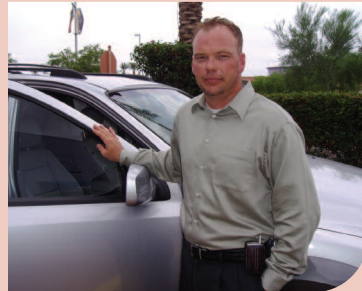
Childress Kia donated a new Kia Spectra to one lucky donor during the drive!