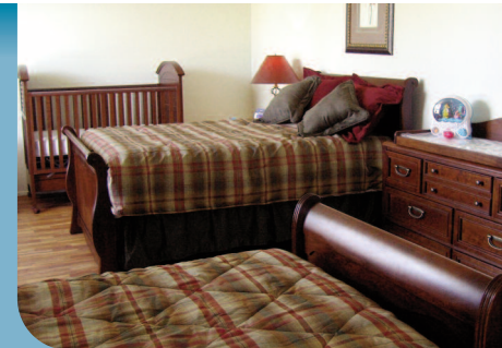
Each of the 6 bedrooms has beautiful new beds and cribs

To find out how you can support Girls Ranch, please call 480-941-0150 or you may make a donation online at www.florencecrittentonofaz.org .