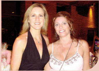
VOS 20-30 Club members enjoy a night in "Vegas"