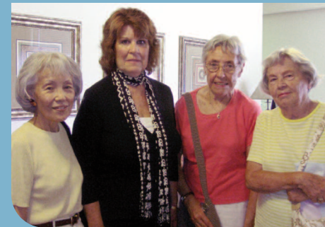
Girls Ranch Auxiliary members from Sedona enjoy the Open House