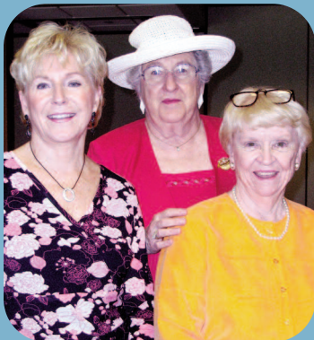
Auxiliary members enjoy the Spring Luncheon and Fashion Show