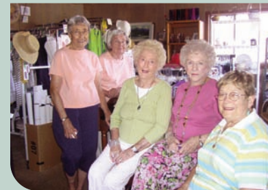
Each of these ladies has tirelessly volunteered at the shop for more than 20 years!