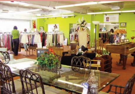
New items arrive daily!