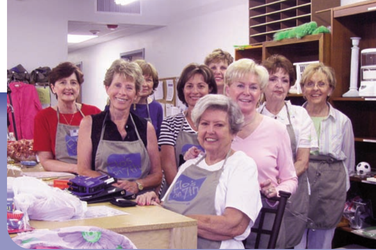
Auxiliary volunteers at Flo's on 7th.

If you would like more information on how you can make a difference in the lives of the children and families Florence Crittenton serves by becoming a member of the Auxiliary, please call 602-288-4567.