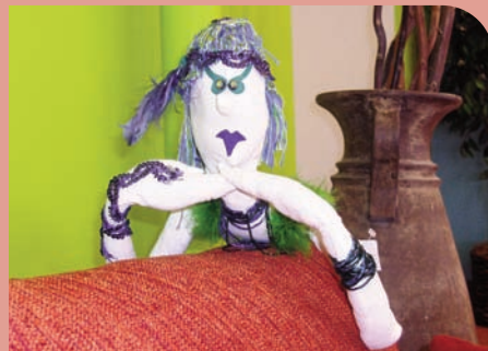
Get to know Flo!

If you are heading up to the cooler country, stop in to our sister-store, the Sedona Girls Ranch Thrift Shop . See page 2 for location and store hours.