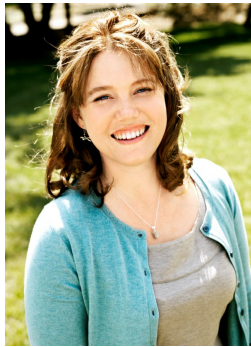
Jaycee Lee Dugard